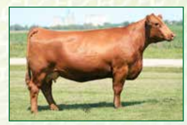
JS Shes So Fine 14P, Dam

Black Dbl. Polled Purebred • ASA#(3841816) BD: 2-10-20 • Tattoo: 988H • Adj BW: 88 ET • Adj WW: N/A